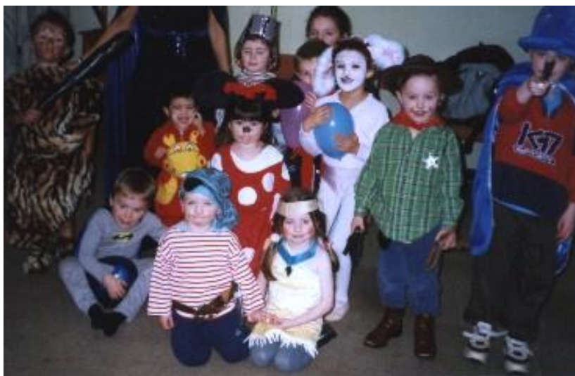
The French Circle's fancy dress pancake party