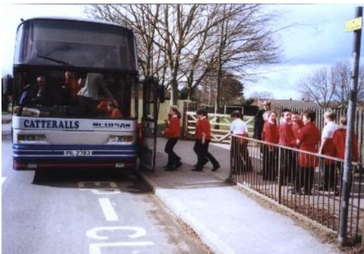
School children set off to visit Southam College for Science Week lessons