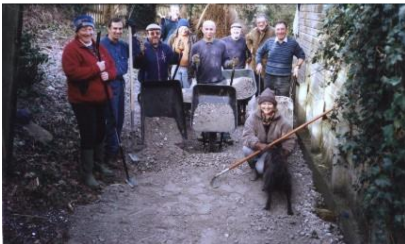
Making light work of Dark Lane!

On the 1 st March all Rights of Way in the Country, which pass over or adjoin agricultural land, common land, woodland, unenclosed land and waste land were closed to the public due to the Foot and Mouth outbreak. As a result all Parish Paths Partnership work in the countryside has been suspended.