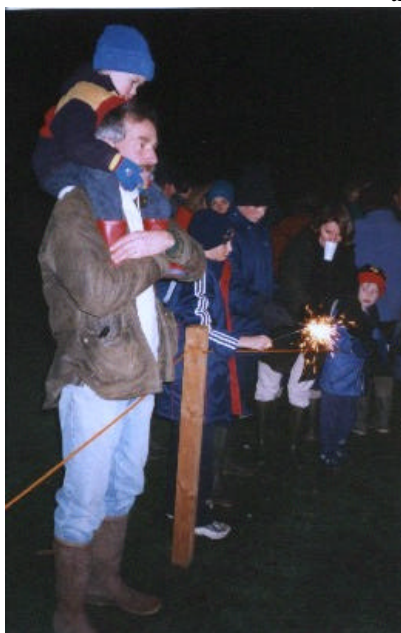
A Grandstand seat