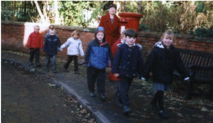
Children walking to Church for Remembrance Day Assembly

In November we remembered two national festivals: Guy Fawkes' efforts to blow up the king in the Houses of Parliament on November 4 th - the bonfire, fireworks and food were splendid and well organised in contrast to the 'gunpowder plot', and Remembrance Day on November 10 th .