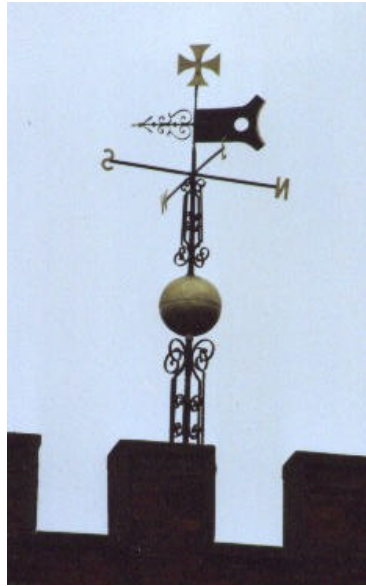
Refurbished weathervane on the Church Tower