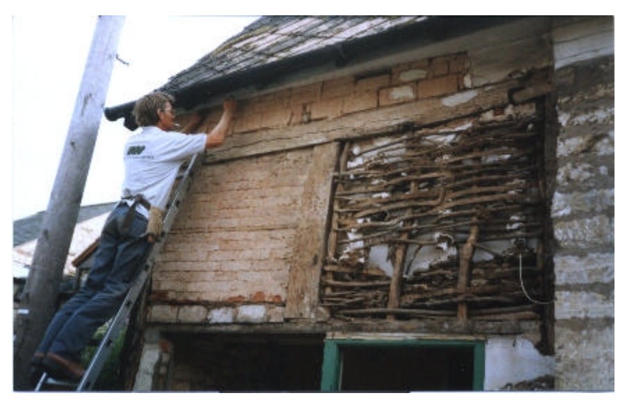
Wattle and daub exposed in High Street