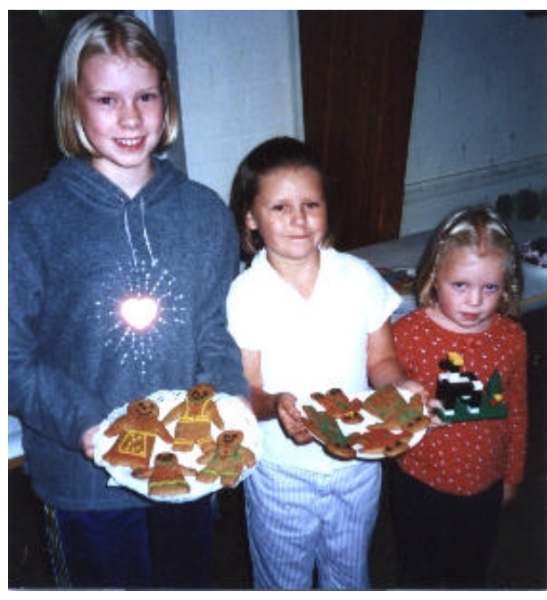
The Clarke girls display their gingerbread men