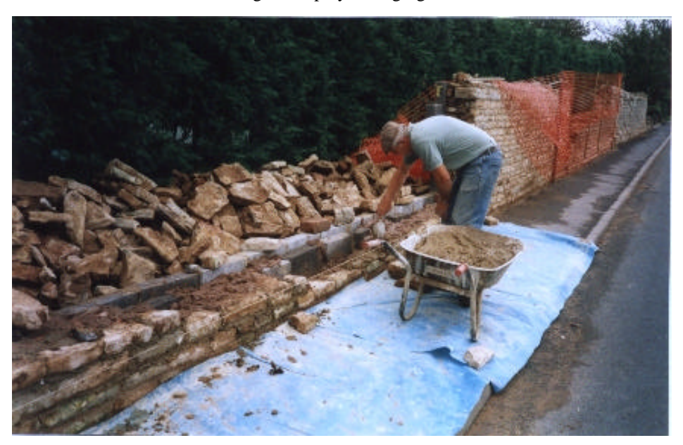
Manor House wall under reconstruction