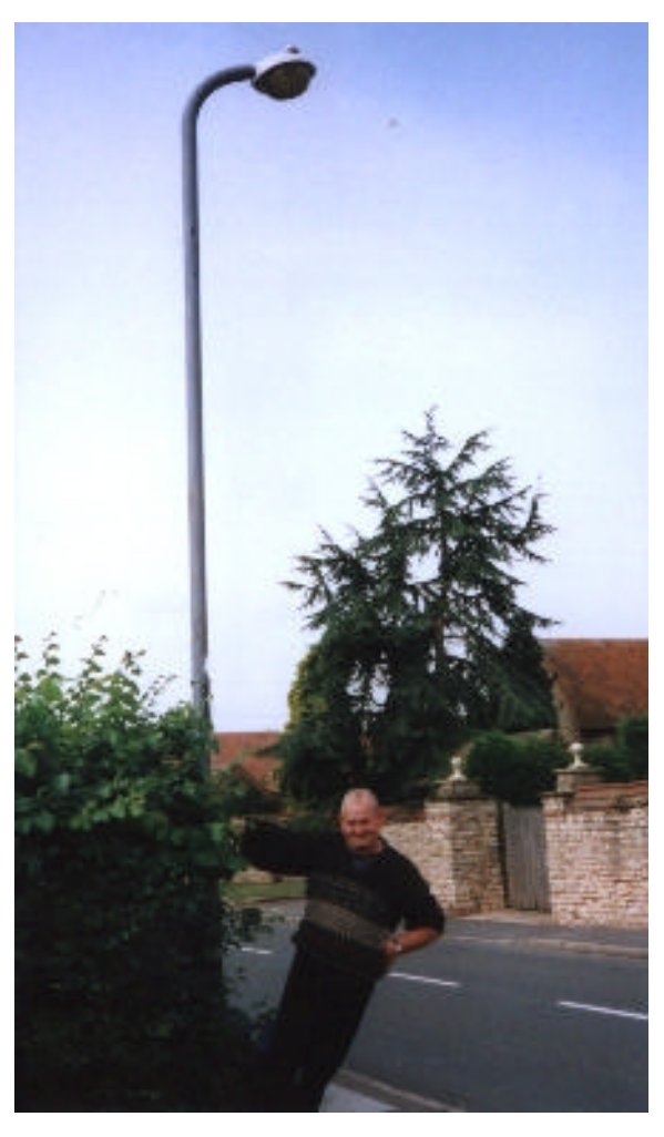
Light Relief! Sid Field with a lamp post, not a bollard